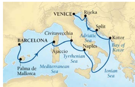
10-DAY ITALY & ADRIATIC GEMS

Seabourn Ovation Barcelona to Venice 23 Oct - 2 Nov 2018