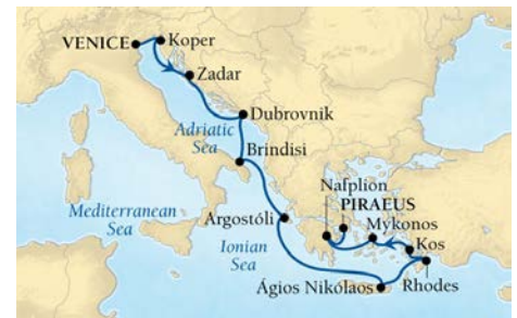
12-DAY ADRIATIC & GREEK ISLES

Seabourn Ovation Venice to Piraeus (Athens) 2 - 14 November 2018