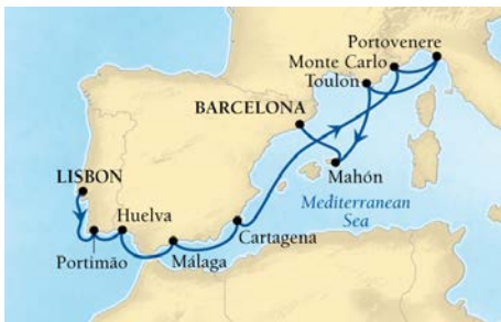
10-DAY SPAIN & THE RIVIERAS

Step into a wondrous world adorned with a sapphire jewel at its center. For those along its shores, the sea remains the heart of it all, an irresistible magnet drawing every gaze. Explore timeless treasures of antiquity as you traverse this celebrated region.